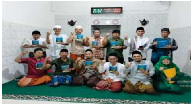
Figure 1. Documentation of Bogor Mengaji in Kedung Halang Bogor City

The flow of the training process for using the Tilawati Mobile Android Application is as follows: